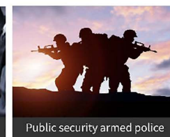
Public security armed police