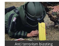
Anti terrorism blasting