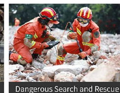
Dangerous Search and Rescue